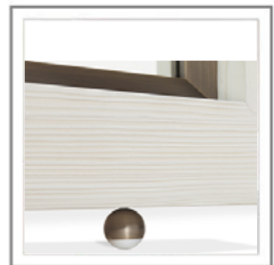
MONET _ Piedino in ottone, finitura Bronzo Antico. | Foot in brass, Antique Bronze finish.