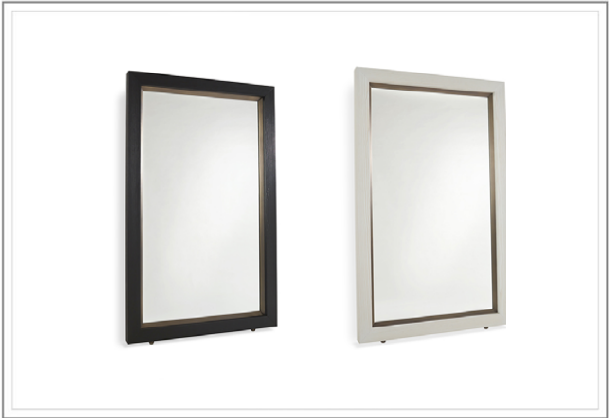
MONET _ Specchiera da appoggio con cornice in Larice Carbone e Larice Bianco (su richiesta). | Floor-standing mirror. Frame made in Carbone Larch and White Larch (upon request).