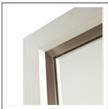
MONET _ Dettaglio specchio con cornice interna in ottone, finitura Bronzo Antico. | Close-up: Mirror detail with inner frame in brass, Antique Bronze finish.