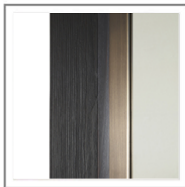
MONET _ Dettaglio cornice. | Frame detail.