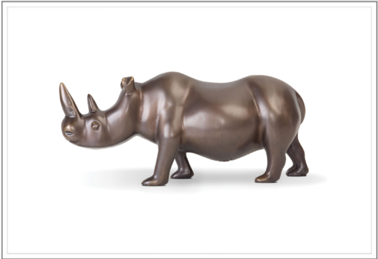
RINO_ Scultura in fusione di ottone a terra, rifinita a mano in finitura bronzo antico | Sand-casting brass sculpture, refined by hand with antique bronze finish.