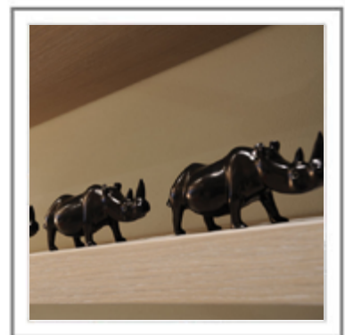
RINO_ Scultura in fusione di ottone a terra, rifinita a mano in finitura bronzo antico | Sand-casting brass sculpture, refined by hand with antique bronze finish.