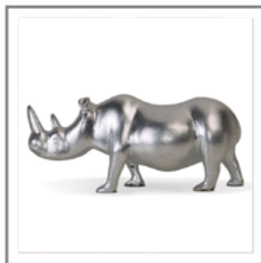
RINO_ Scultura in fusione di ottone a terra, rifinita a mano in finitura foglia argento | Sand-casting brass sculpture, refined by hand with silver leaf finish.