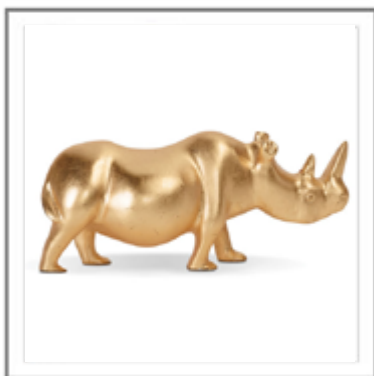
RINO_ Scultura in fusione di ottone a terra, rifinita a mano in finitura foglia oro | Sandcasting brass sculpture, refined by hand with gold leaf finish.