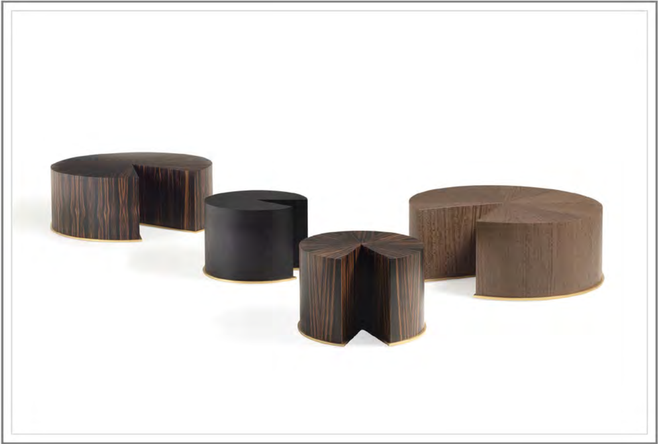
PACMAN_ Tavolino da caffè d.92cm e d.52cm in diverse finiture: ebano, rovere tinto moka e eucalipto friséè scuro. Base in metallo, finitura gold. | Coffee table d.92cm and d.52cm in different finishes: ebony, moka stained oak and dark eucalyptus friséè . Base in metal, gold finish.