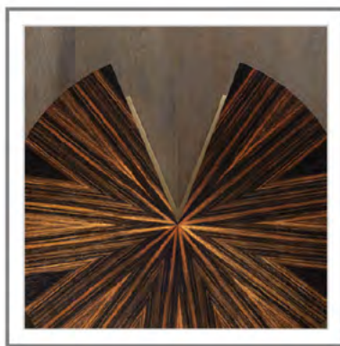
PACMAN_ Dettaglio top in ebano con intarsio. | Close-up: Inlaid top, ebony finish.