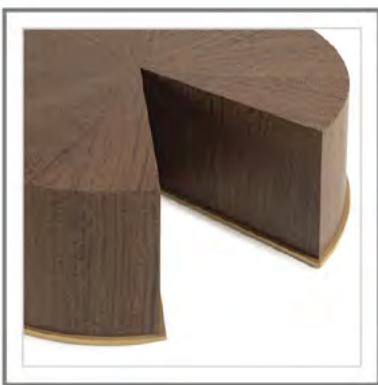
PACMAN_ Dettaglio tavolino in eucalipto friséè scuro. Base in metallo, finitura gold. | Coffee table detail in dark eucalyptus friséè. Base in metal, gold finish.