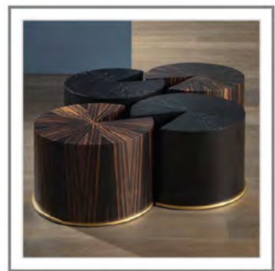
PACMAN_ Ambientazione. | Room setting.