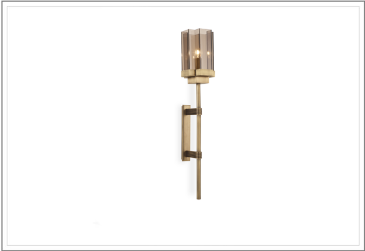
YISHI_ Applique con struttura in ottone, finitura bronzo antico e paralume in vetro ambrato | Sconce with structure in brass, antique bronze finish with diffusers in amber glass.