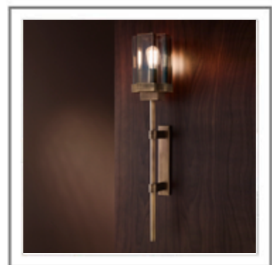
YISHI_ Applique con struttura in ottone, finitura bronzo antico e paralume in vetro ambrato | Sconce with structure in brass, antique bronze finish with diffuser in amber glass.