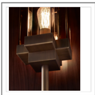
YISHI_ Dettaglio struttura con paralume in vetro ambrato | Close-up: structure and amber glass lampshade.