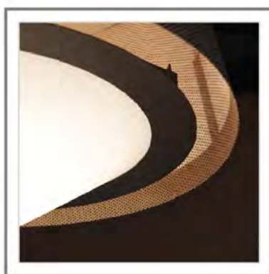
OLYMPIA_ Dettaglio interno paralume in metallo traforato | Close-up: inner lampshade in perforated metal.