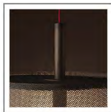
OLYMPIA_ Dettaglio sospensione con filo rosso | Ceiling lamp detail: red cord.