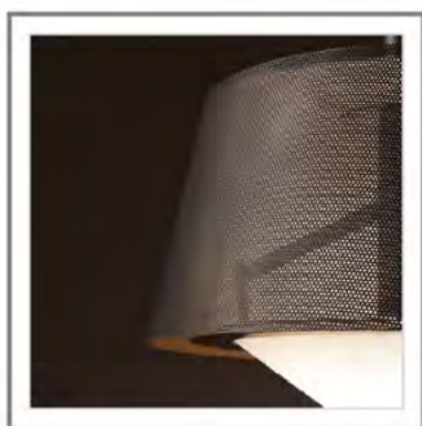
OLYMPIA_ Dettaglio paralume in metallo traforato, diffusore in vetro opalino | Closeup: Lampshade in perforated metal with diffuser in opaline glass.