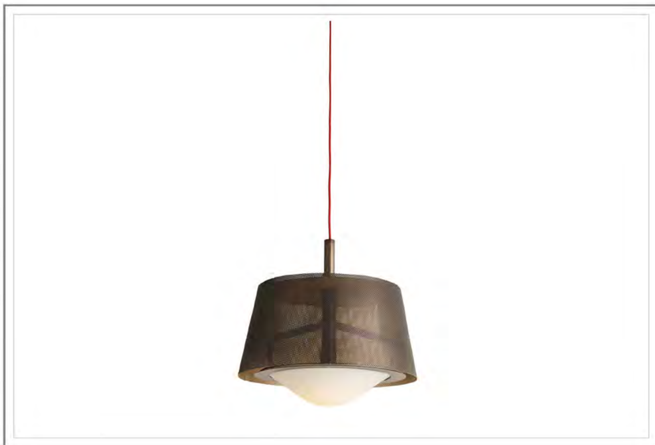
OLYMPIA_ Lampada a sospensione con paralume in metallo forato e diffusore in vetro opalino | Ceiling lamp with structure in perforated metal and diffuser in opaline glass.