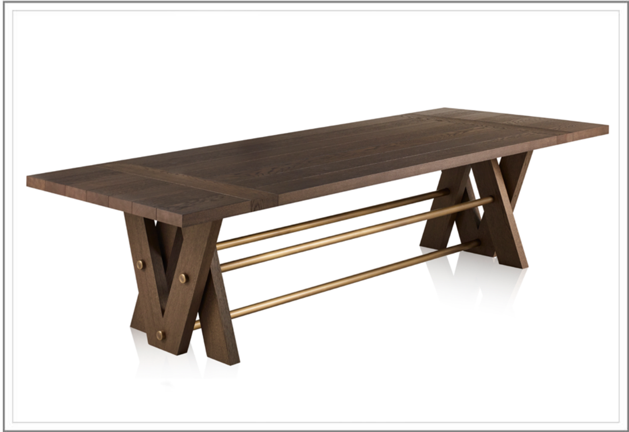
DOUBLE V_ Tavolo da pranzo con struttura in rovere tinto grigio, base con profili in ottone finitura bronzo antico. | Dining table in grey stained oak, base with brass rods in antique bronze finish.