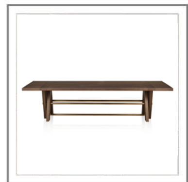
DOUBLE V_ Vista frontale tavolo da pranzo con struttura in rovere tinto grigio, base con profili in ottone finitura bronzo antico. | Frontal view dining table in grey stained oak, base with brass rods in antique bronze finish.