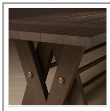
DOUBLE V_ Dettaglio gamba e top | Detail view: leg and top