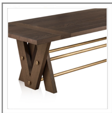
DOUBLE V_ Dettaglio gamba con profili in ottone, finitura bronzo antico. | Close-up leg with brass rods in antique bronze finish