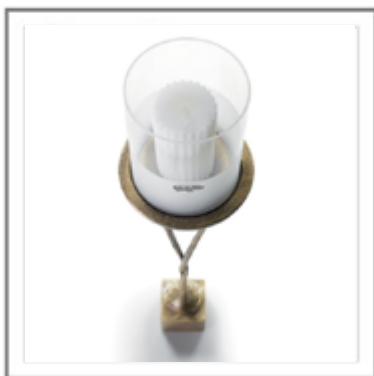
YWKO_ Dettaglio dall'alto | Top view.