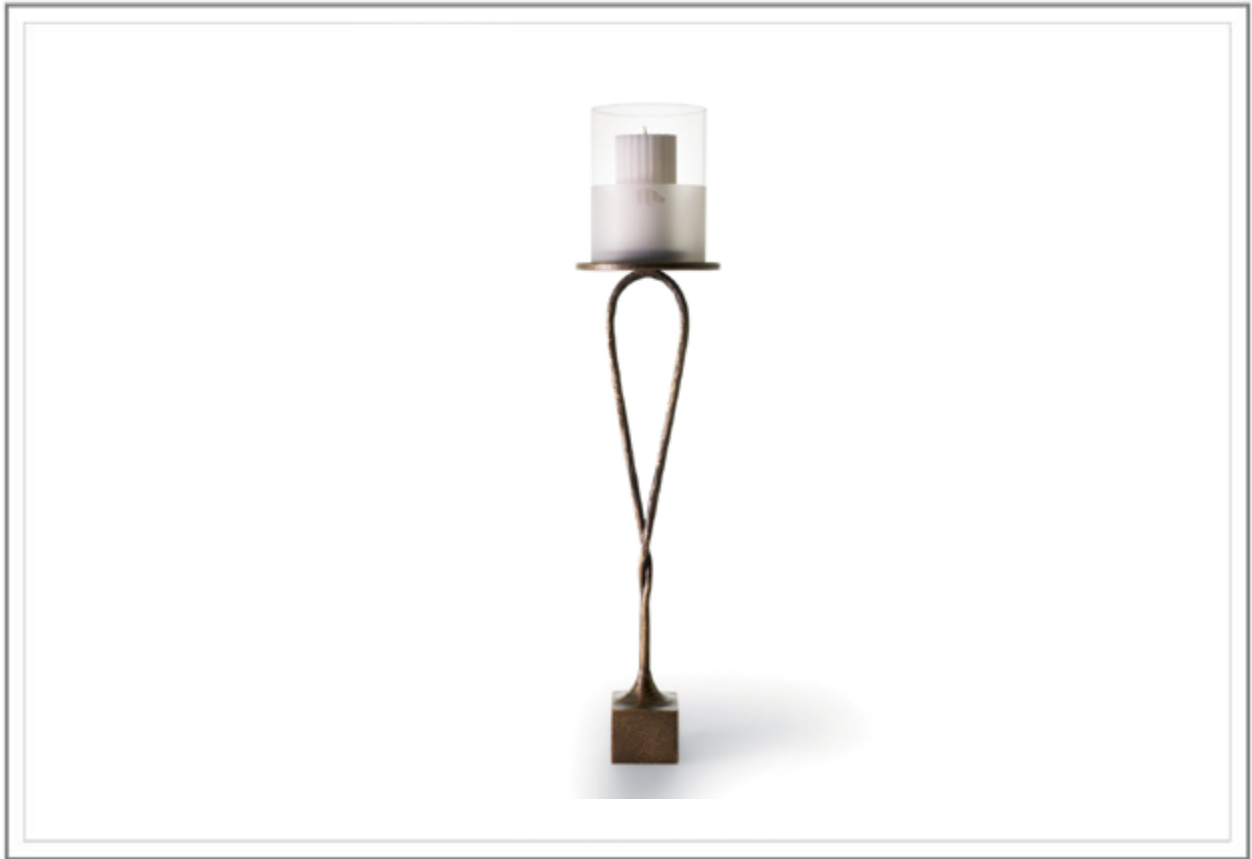
YWKO_ Porta candela in fusione di ottone martellinato, finitura Bronzata rifinita a mano. Diffusore in vetro trasparente e satinato | Candle-holder in cast brass, Bronzed finish refind by hand. Diffuser in clear and sandblasted glass.