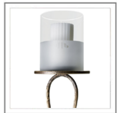
YWKO_ Dettaglio diffusore in vetro trasparente e satinato con dettaglio logo ad Ippopotamo | close-up of diffuser in clear and sandblasted glass with Hippo logo detail.