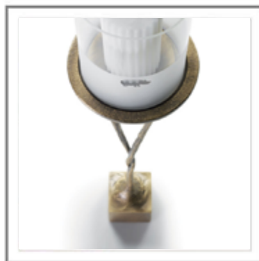
YWKO_ Dettaglio base in fusione di ottone martellinato, finitura Bronzata rifinita a mano. | Base detail in cast brass, Bronzed finish refind by hand.