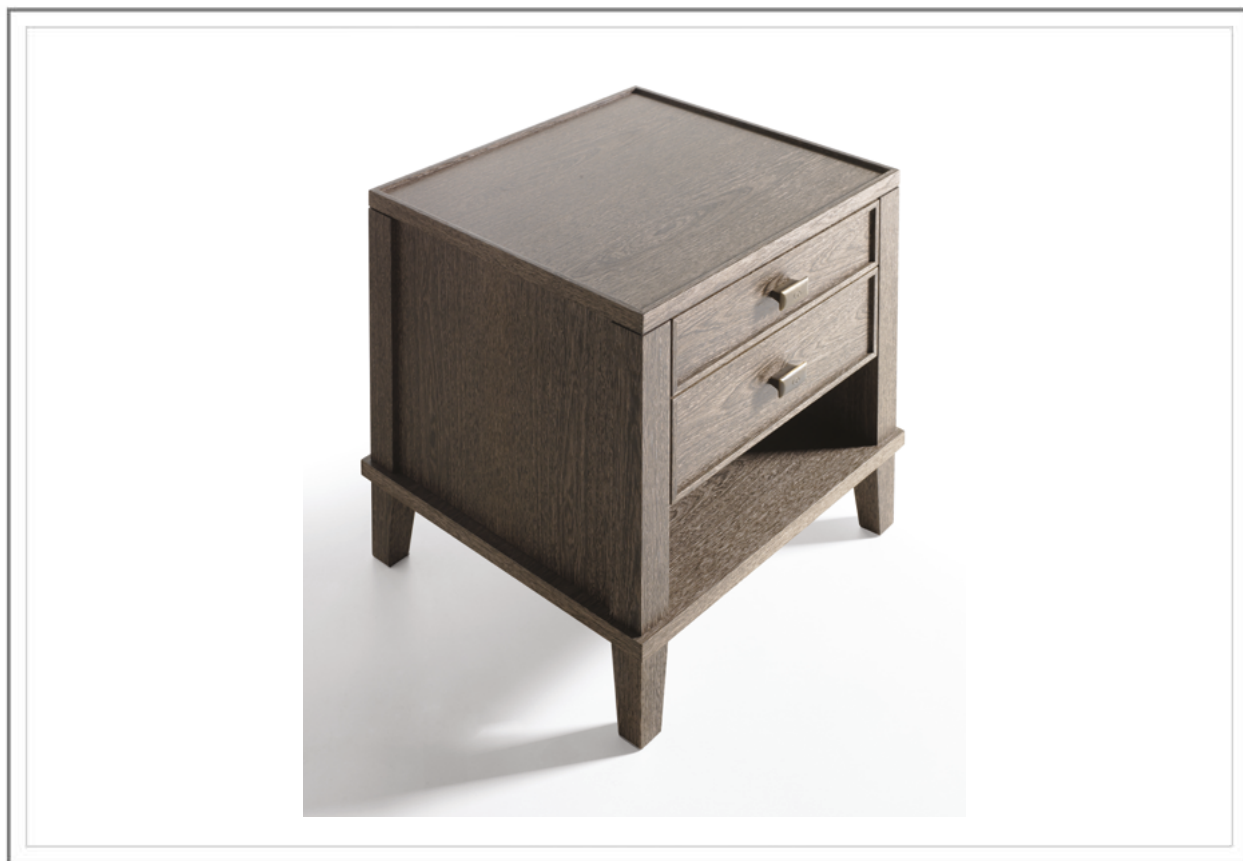
SIMPLE_ Comodino in sucupira grigio | Nighstand in grey sukupira wood.