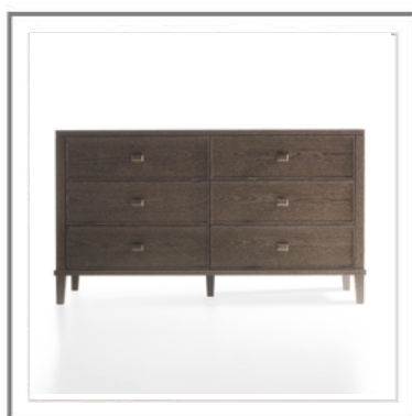
SIMPLE_ Comò in sucupira grigio | Drawers unit in grey sukupira wood.