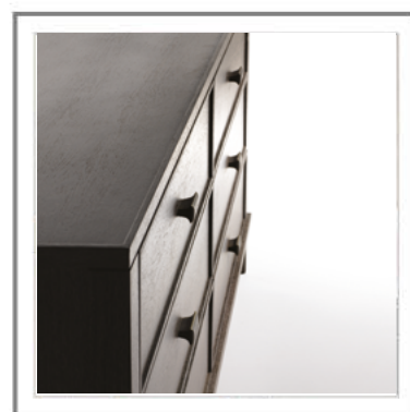
SIMPLE_ Dettaglio maniglia in fusione di ottone, finitura Bronzata con incisione del logo a Ippopotamo | Close-up view of the handles in cast brass, Bronzed finish with engraved Hippo logo.