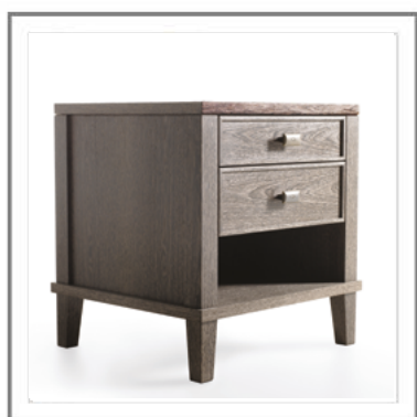
SIMPLE_ Comodino in sucupira grigio | Nighstand in grey sukupira wood.