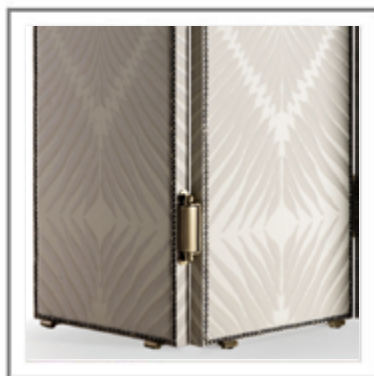
MY SECRET_ Dettaglio piedini in metallo, finitura ottone antico | Close up of feet, made in metal, antique brass finish.