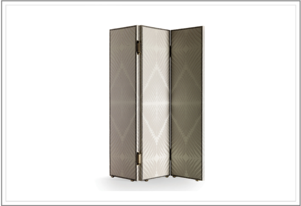
MY SECRET_ Separé pieghevole, rivestito in tessuto con borchie perimetrali in metallo, ottone antico. | Folding separé upholstered in fabric with studs along the sides in metal, antique brass finish.