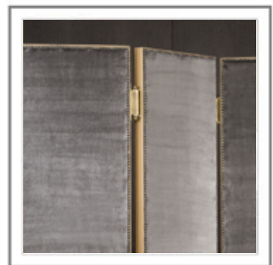
MY SECRET_ Dettaglio profili pannelli rivestiti in pelle (optional) | Close up of edges wrapped in leather (optional).