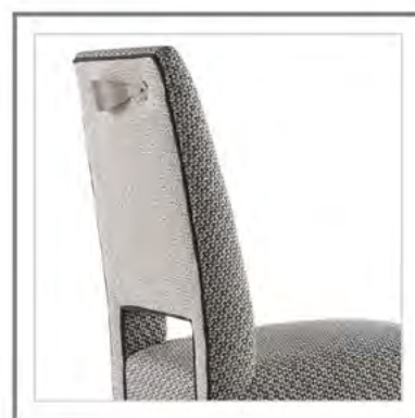
MARGOT_ Dettaglio schienale sedia con piping in pelle (su richiesta) e maniglia in metallo (su richiesta) | Close-up: rear back with piping in leather (upon request) and metal handle (upon request).