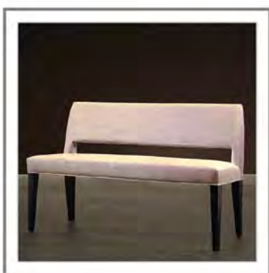
MARGOT_ Panca rivestita in tessuto con base in faggio tinto moka | Bench upholstered in fabric with base in solid moka stained beechwood.