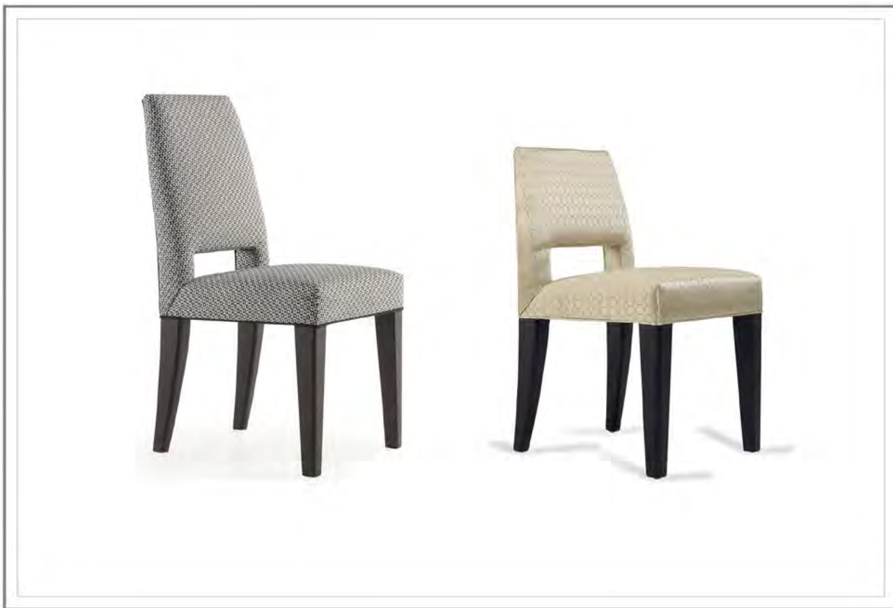
MARGOT_ Sedia rivestita in tessuto, versione schienale alto e basso, con base in faggio tinto moka | High and low back chair, upholstered in fabric with base in solid moka beechwood.