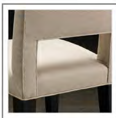
MARGOT_ Dettaglio schienale sedia | Back chair detail.