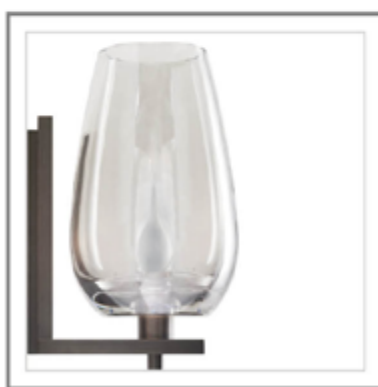
LUME_ Dettaglio paralume in cristallo trasparente | Close-up diffusers in clear crystal