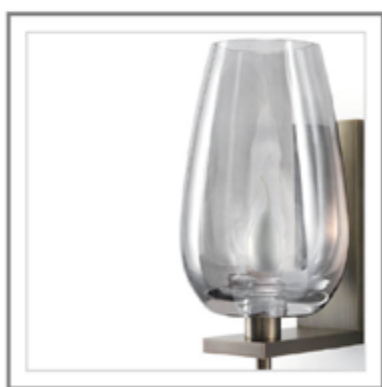
LUME_ Dettaglio paralume in cristallo fumé | Close-up diffusers in smoked crystal