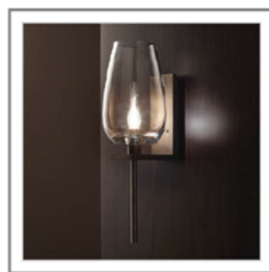
LUME_ Ambientazione | Room setting