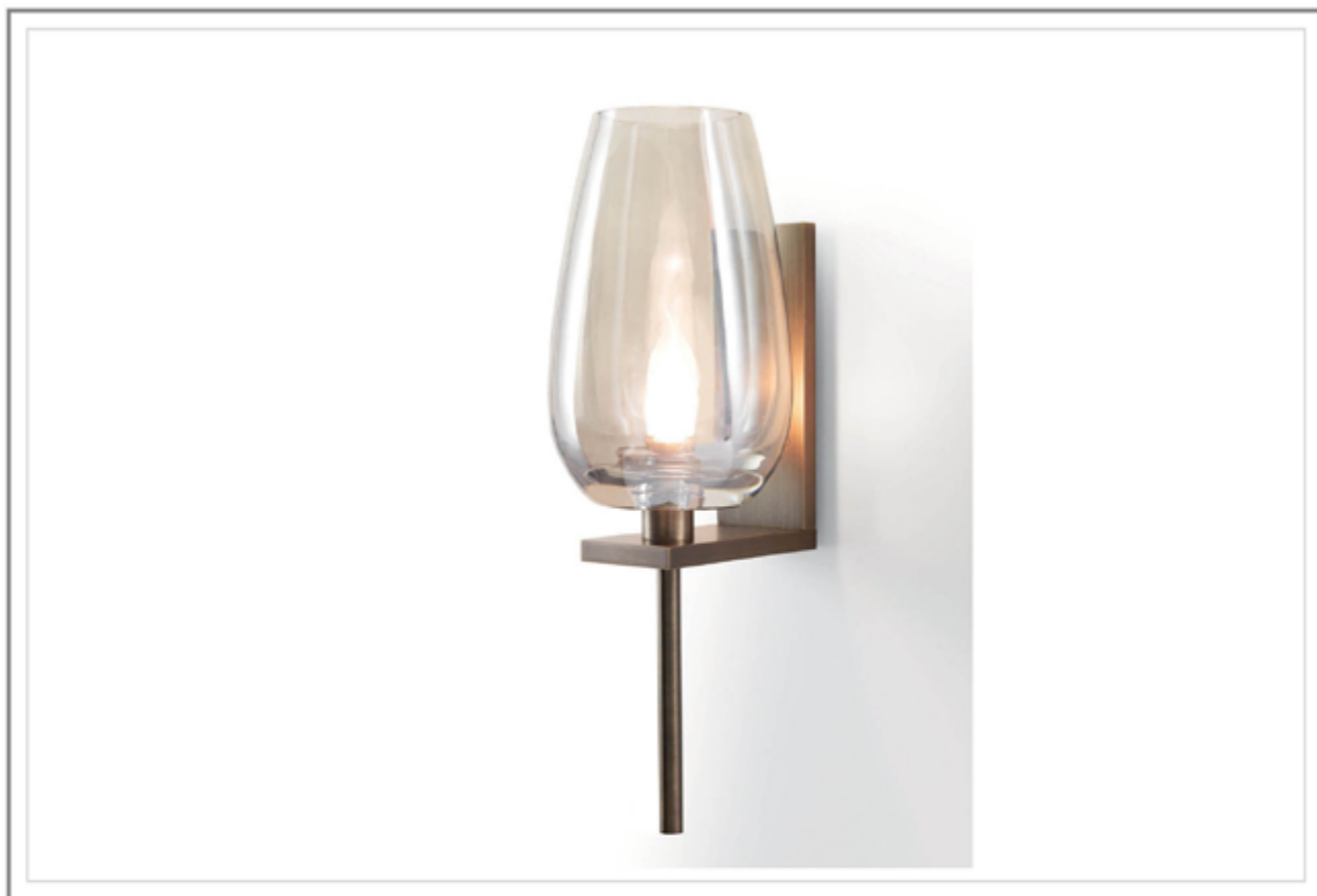
LUME_ Applique con struttura in bronzo antico e paralume in cristallo fumé | Sconce with antique bronze structure and smoked crystal lampshade