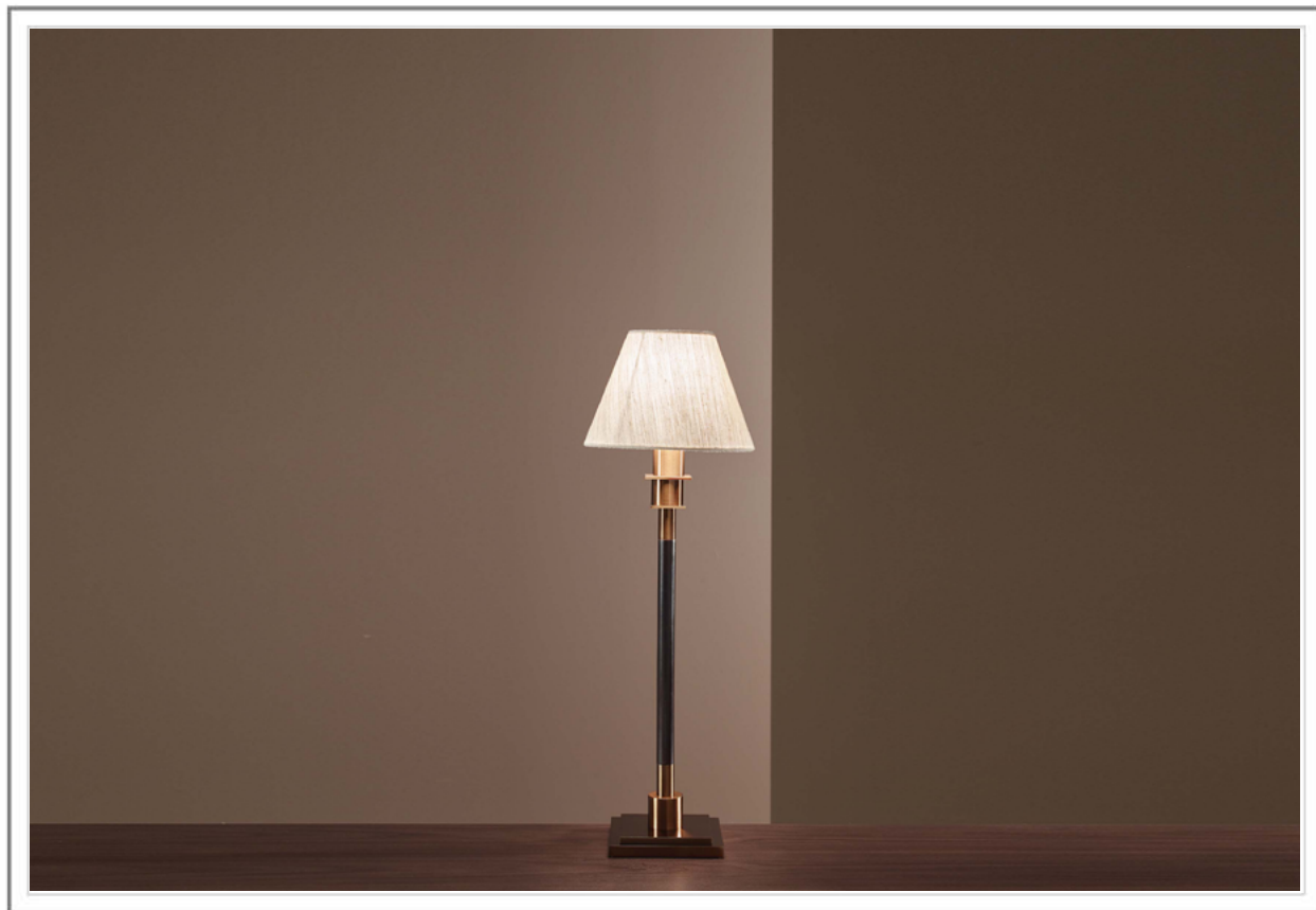
LORENA_ Lampada da tavolo con struttura in massiccio di faggio tinto moka, base e dettagli in metallo finitura Brandy. Paralume in lino naturale. | Table lamp with structure in solid moka stained beechwood, base and details in metal Brandy finish. Lampshade in natural linen.