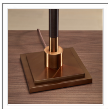
LORENA_ Dettaglio base in metallo, finitura Brandy finish | Close-up: metal base, in Brandy finish.