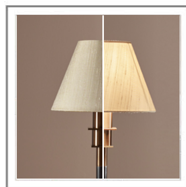
LORENA_ Paralumi: a Sinistra in lino naturale, a destra in seta avorio. | Lampshades: natural linen on the left; ivory silk on the right.