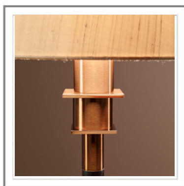
LORENA_ Dettaglio struttura | Close-up of the structure.