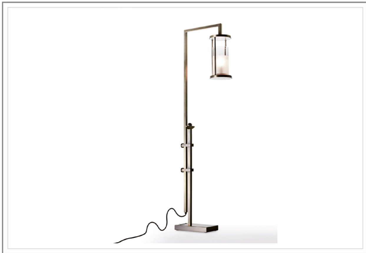
LANTERNA_ Lampada da terra con struttura in metallo, finitura bronzo antico | Floor lamp with structure in metal, antique bronze finish.