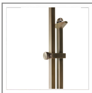
LANTERNA_ Dettaglio struttura in metallo, regolabile in altezza | Detail structure in metal with adjustable height.