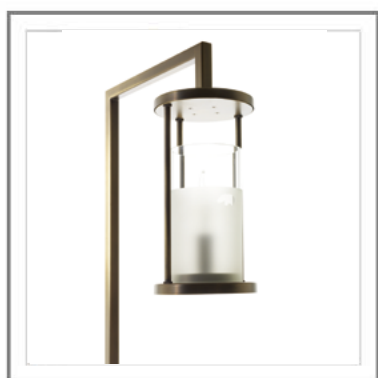
LANTERNA_ Dettaglio paralume in vetro trasparente e satinato | Detail view: lampshade in clear and sandblasted glass .