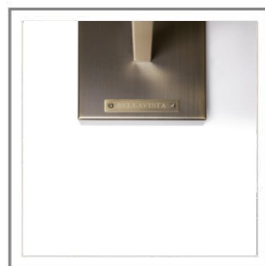
LANTERNA_ Dettaglio base lampada | Detail view: lamp base.