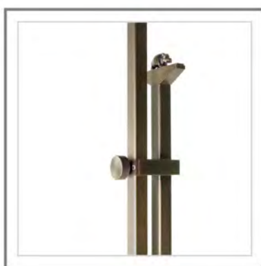
LANTERNA_ Dettaglio struttura in metallo, regolabile in altezza | Detail structure in metal with adjustable height.