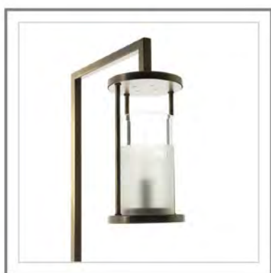
LANTERNA_ Dettaglio paralume in vetro trasparente e satinato | Detail view: lampshade in clear and sandblasted glass .