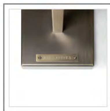
LANTERNA_ Dettaglio base lampada | Detail view: lamp base.