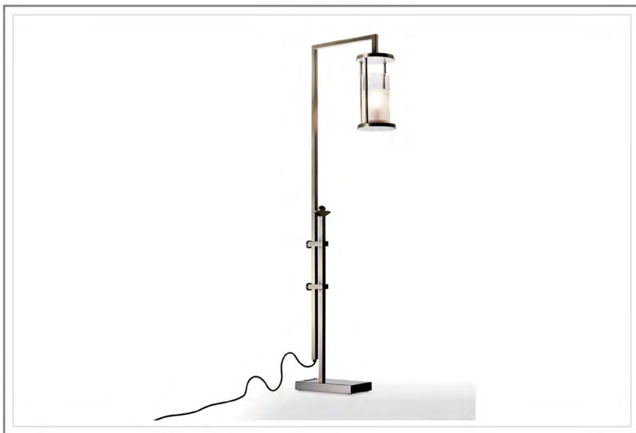
LANTERNA_ Lampada da terra con struttura in metallo, finitura bronzo antico | Floor lamp with structure in metal, antique bronze finish.