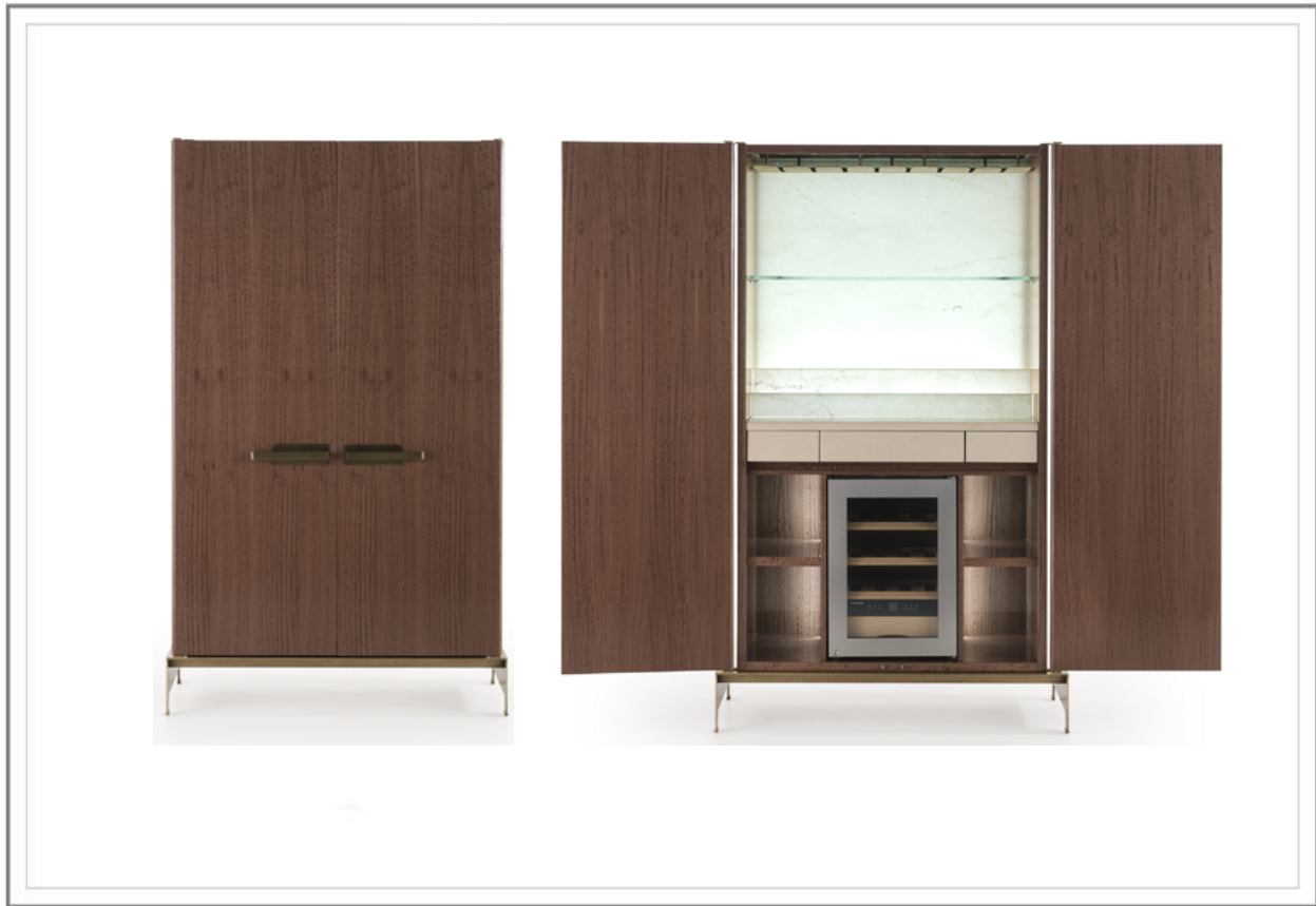
HIM_ Mobile bar in eucalypto friséé scuro, finitura lucida (optional) con base e maniglia in finitura ottone antico. Dettaglio vista interna | Bar unit in glossy dark eucalypto friséé with base and handle in antique brass finish. Inner detail view.