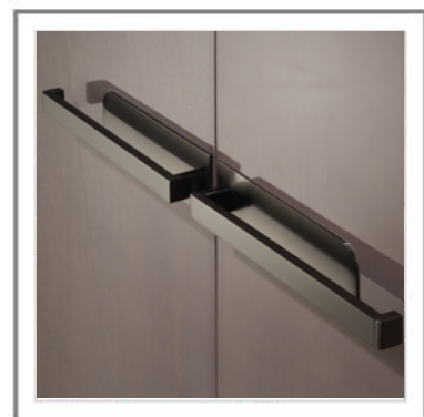
HIM_ Dettaglio maniglie in ottone, finitura nickel nero lucido (finitura non standard, su richiesta) | Handles detail in brass, polished black nickel (not standard finish, upon request).