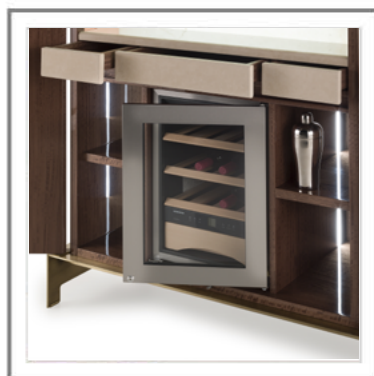
HIM_ Dettaglio interno: Cassetti con frontali rivestiti in cuoio e cantinetta refrigerata (su richiesta) | Detail view: drawers with frontals padded in saddle-leather and wine cooler (UPON REQUEST).