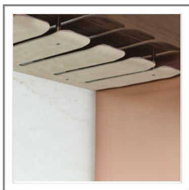
HIM_ Dettaglio interno: portabicchieri in cuoio, fianco laterale in rame e schienale retroilluminato in marmo calacatta (Optional). | Detail view: Glass holder in saddle-leather, sides padded in copper finish sheets and inner back in backlit calacatta marble (optional).