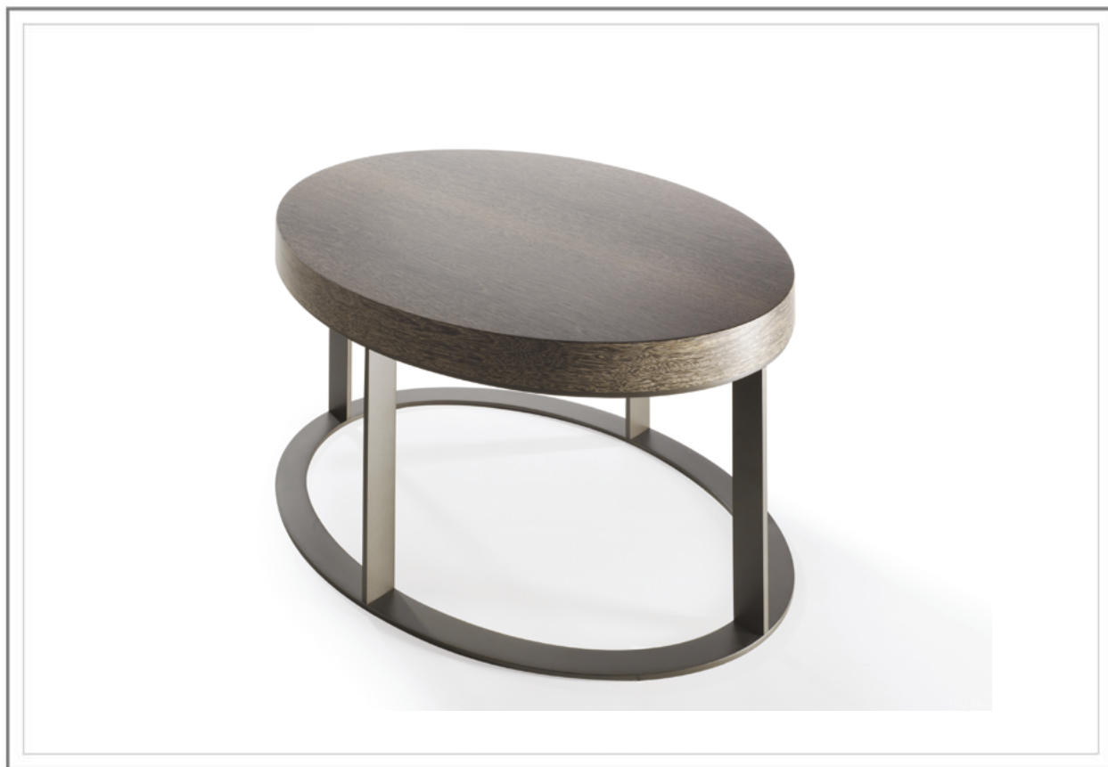
EROS_ Tavolino con struttura in metallo, finitura bronzo con top in sucupira grigio | Coffee and side table, base in metal bronze finish with top in grey sukupira.