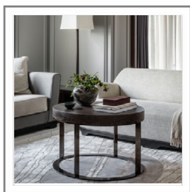
EROS_ Ambientazione. | Room setting.