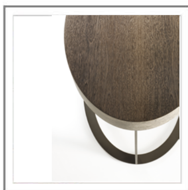
EROS_ Tavolino struttura in metallo, finitura bronzo con top in sucupira grigio | Coffee table, base in metal bronze finish with top in grey sukupira.