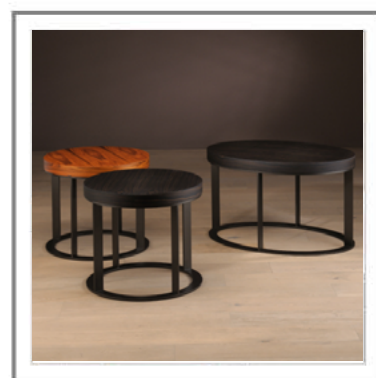
EROS_ Tavolini con base in finitura bronzo e top, da sinistra, in palissandro e rovere moka. | Side tables with base in bronze finish, top (from the left) in rosewood and moka oak.