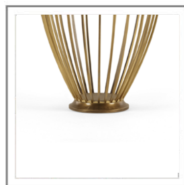
AMELIE_ Dettaglio base lampada | Closeup base table lamp