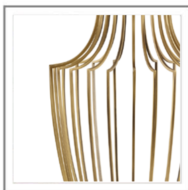
AMELIE_ Dettaglio struttura in metallo, finitura ottone antico | Close-up structure in metal, antique brass finish.