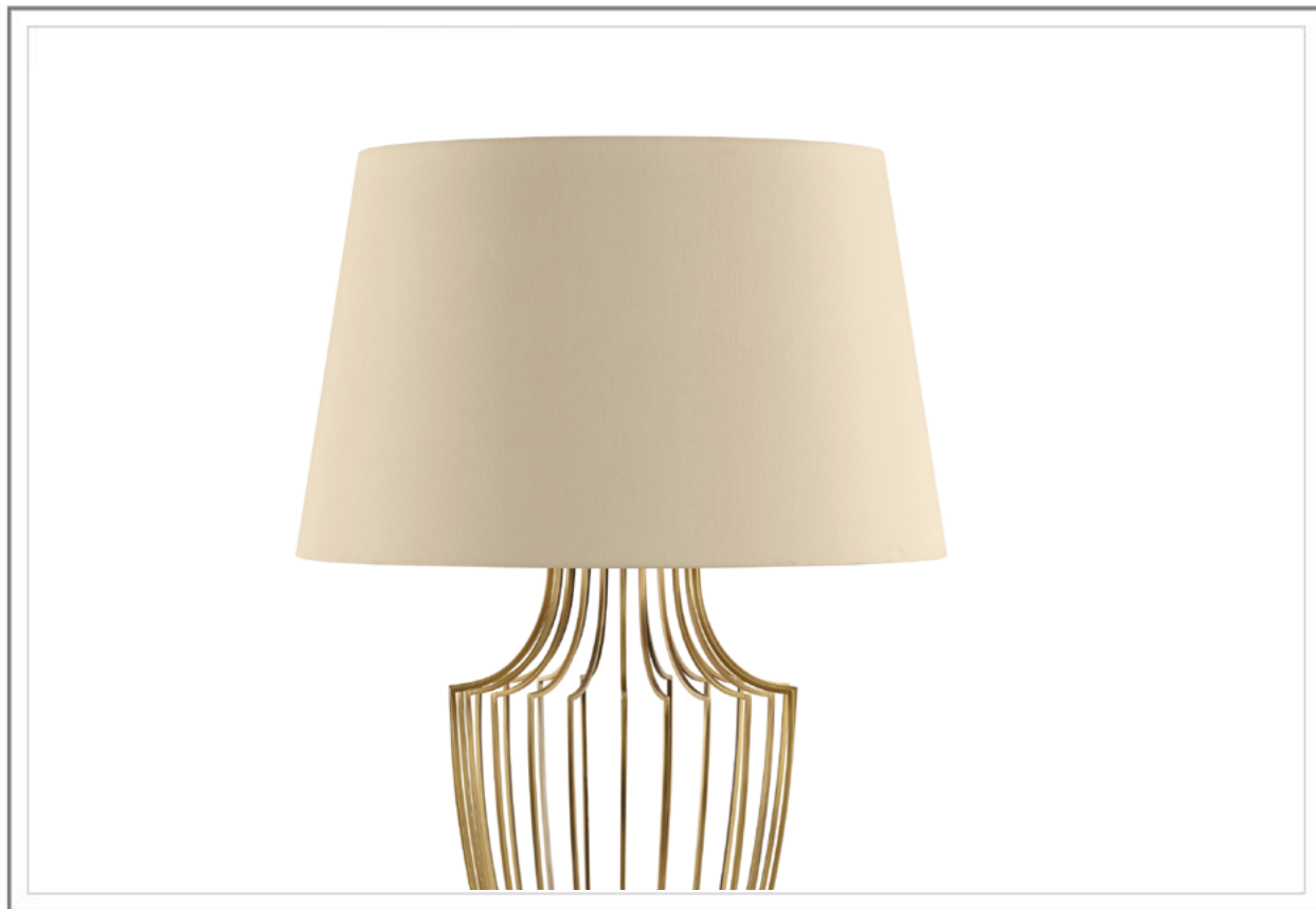
AMELIE_ Lampada da tavolo con struttura in metallo, finitura ottone antico e paralume in viscosa beige | Table lamp with structure in metal, antique brass finish with lampshade in beige viscose.