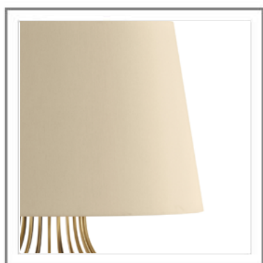
AMELIE_ Dettaglio paralume in viscosa beige | Detail view: beige viscose lampshade.