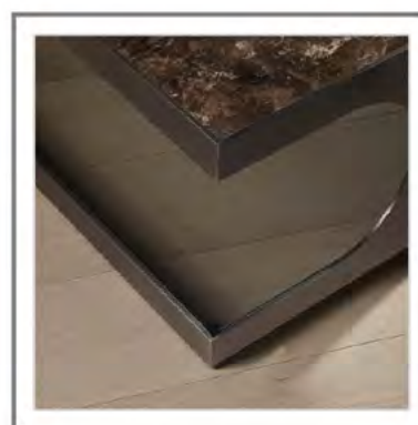
ALBERT_ Vista della mensola inferiore in vetro fumé | View of the lower shelf in smoked glass.