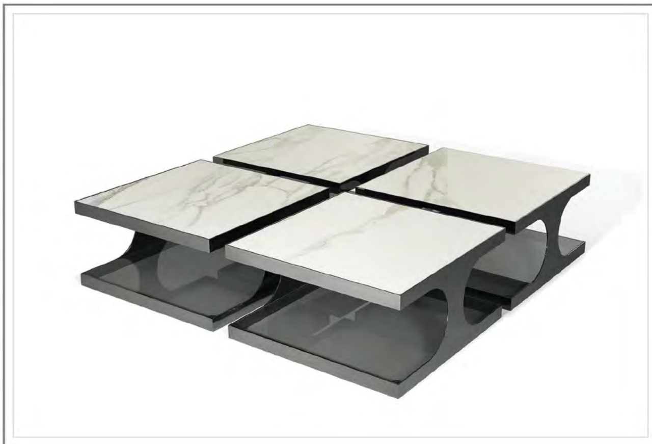
ALBERT_Tavolino da caffè con base in nickel nero lucido e top in marmo calcatta. | Coffee table with base in polished black nickel and top in calcatta marble.