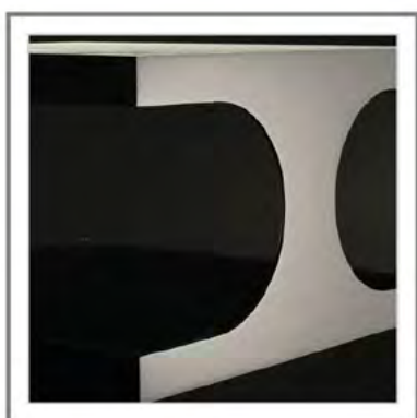
ALBERT_ Dettaglio struttura in metallo, finitura nickel nero lucido | Close up of structure in metal, polished black nickel finish.