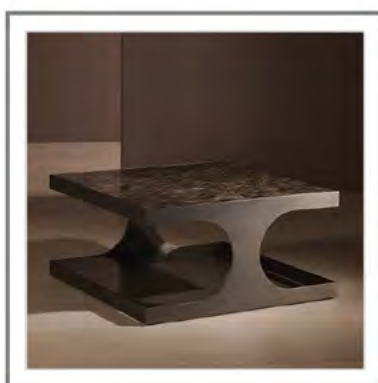
ALBERT_Tavolino da caffè con base in bronzo antico e top in marmo emperador dark brown. | Coffee table with base in antique bronze and top in emperador dark brown marble